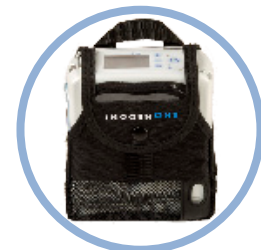
Inogen One ® G4 Bag* Item # CA-400