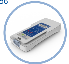
Inogen One ® G4 Lithium Ion Battery* Up to 2.7 hours run time Item #BA-400

Approximately half the size of the Inogen One G3!