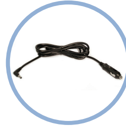
Inogen One ® G4 DC Power Cable* Item # BA-306