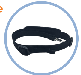
Inogen One ® G4 Carry Strap* Item # CA-401

Approximately half the size of the Inogen One G3!