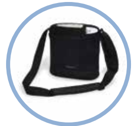
Inogen One ® G3 Carry Bag* Item # CA-300