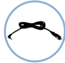
Inogen One ® G3 DC Power Cable* Item # BA-306