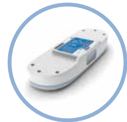
Inogen One ® G3 Lithium Ion Battery* Up to 4.7 hours run time Item #BA-300