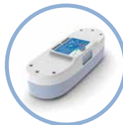
Inogen One ® G3 Extended Life Lithium Ion Battery** Up to 10 hours run time Item #BA-316