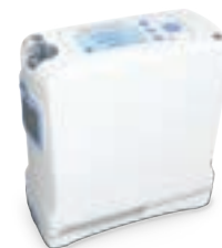
Inogen One G4