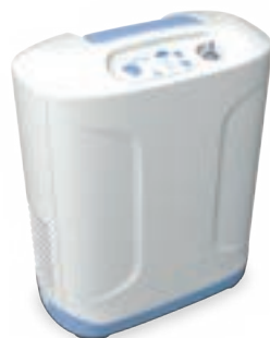
Inogen At Home