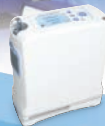
Inogen One G4

*Based on technical performance test data.