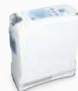
Inogen One G4