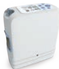
Inogen One G5