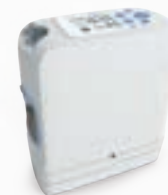
Inogen One G5