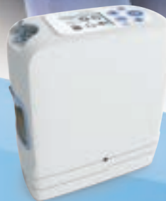
Inogen One G5

Call 1-800-819-0646 to reclaim your mobility.