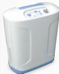
Inogen At Home

From the convenience of our popular Inogen One series to its reliable, pulse-dose based Intelligent Delivery Technology, Inogen helps patients receive the benefits of oxygen therapy while maintaining their active lifestyles. This guide will introduce you to Inogen's line of oxygen therapy solutions. To confirm the right option for you, call 1-800-819-0646 to speak with an oxygen specialist.