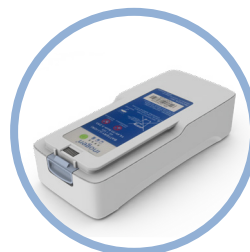
Inogen One ® G4 Extended Life Lithium Ion Battery** Up to 5 hours run time Item #BA-408