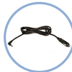
Inogen One ® G4 DC Power Cable* Item # BA-306