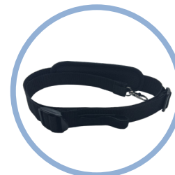
Inogen One ® G4 Carry Strap* Item # CA-401