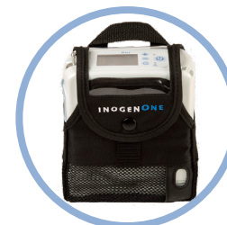
Inogen One ® G4 Carry Bag* Item # CA-400