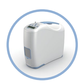
Inogen One Concentrator*