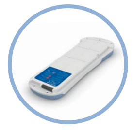
Additional Inogen One Battery**