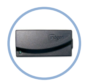
Inogen One Universal Power Supply*