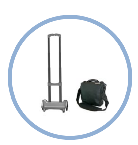
Inogen One Cart & Carry Bag*