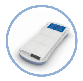
Inogen One Battery*